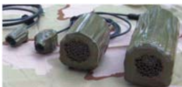
Day / Thermal Cameras