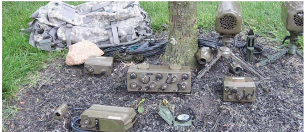
Note: 50% reduction in size, weight, and volume when compared to the currently fielded Scorpion System